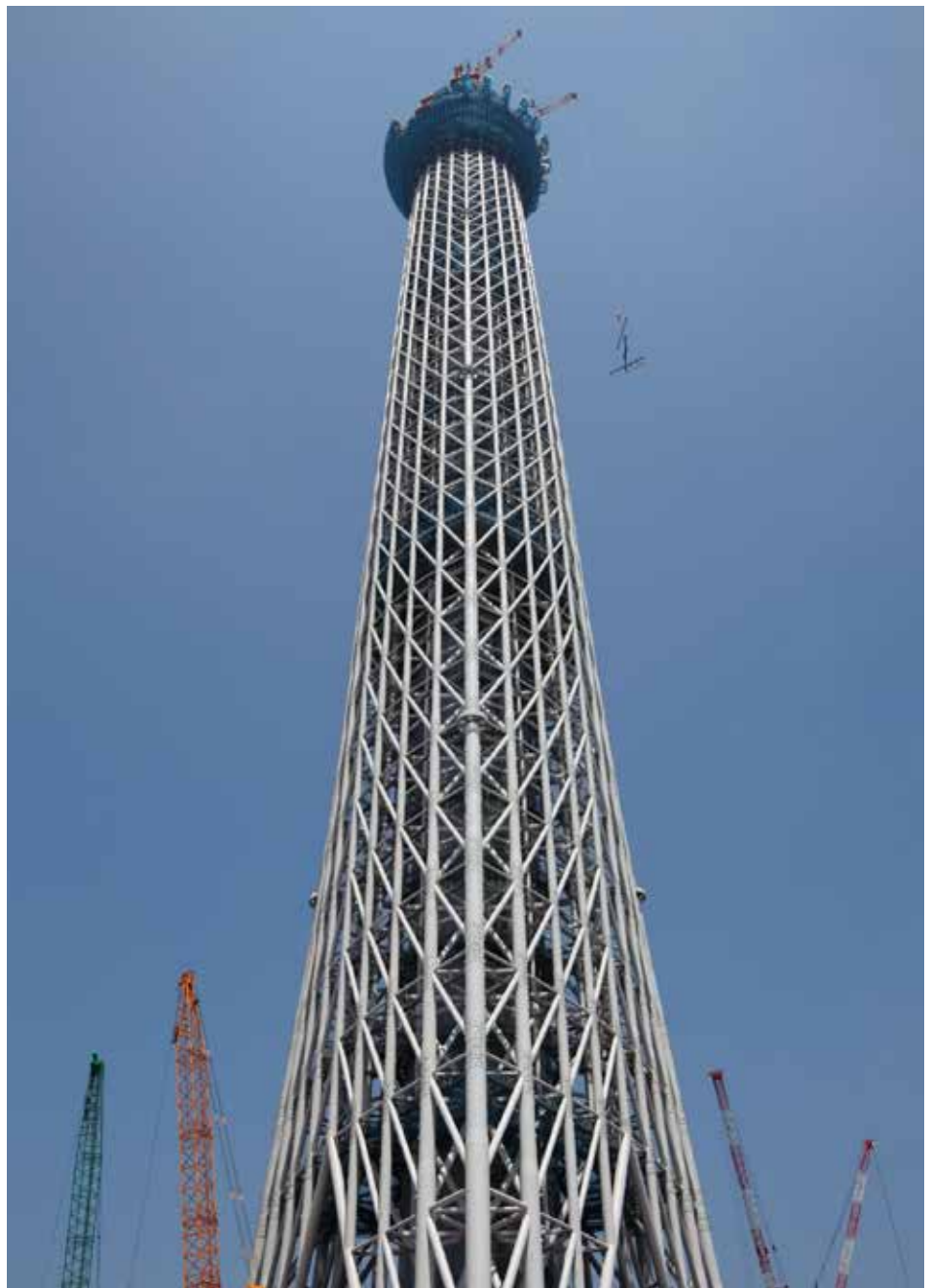
Sika's concrete superplasticizers were also applied in the highest broadcasting tower in the world: the Tokyo Sky Tree.

It remains vitally important to develop products and systems that can be used to construct more durable, energy-efficient eco-buildings, and concrete can fulfill this very remit. With its strength, durability and excellent thermal mass, concrete is a key component in eco-buildings of today and the future. <