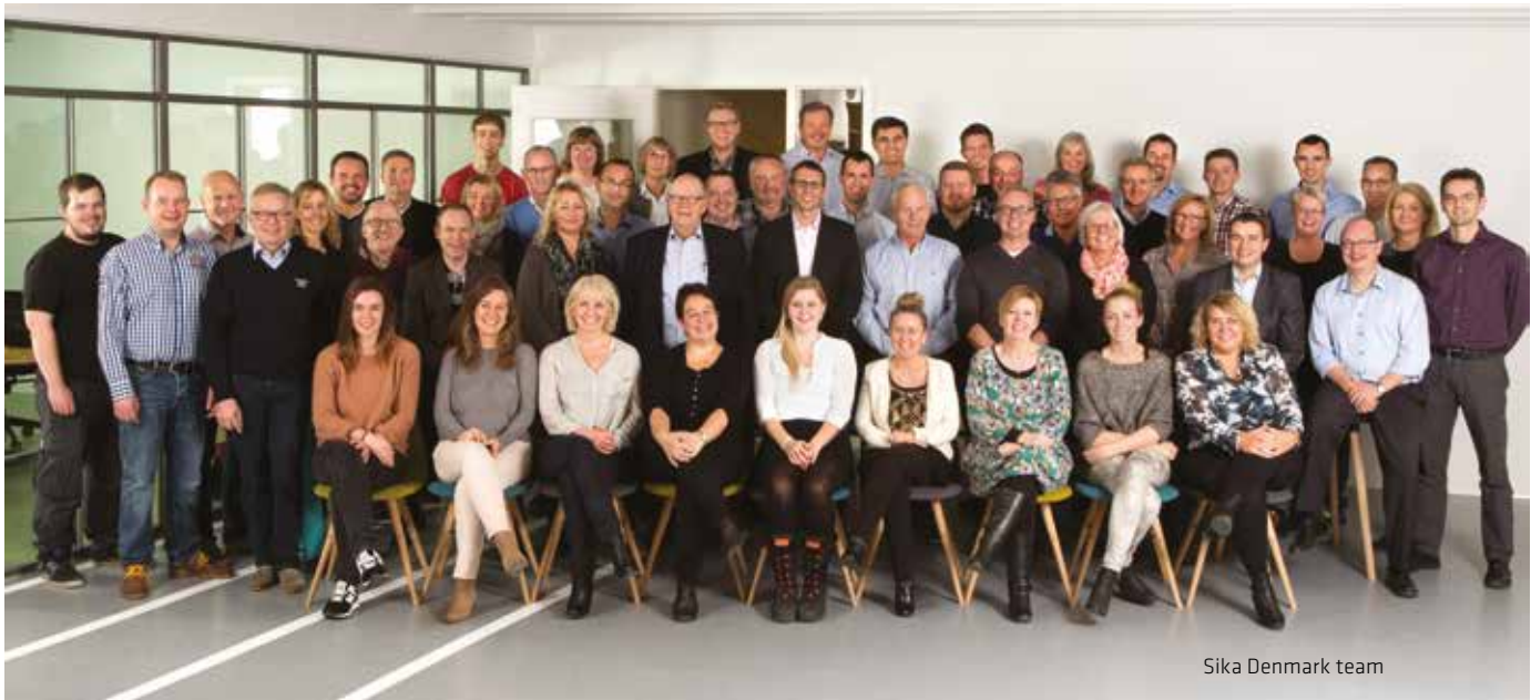
Sika Denmark team

It's windy in Denmark, which helps explain why Denmark is so skilled at capturing the power of the wind. Relying on 28% wind power for its electricity system, Denmark is a nation that many others are looking to in order to discover sustainable energy solutions for the future. However, plentiful wind is not necessarily synonymous with a strong wind industry. Denmark's achievement in bringing 28% wind power into the electricity system is built on several key factors, that together have made Denmark the world's wind power hub. Denmark's role as a first mover in both onshore and offshore wind power has been important. The lessons learned through the early years of setting up wind turbines across the nation have been pivotal. The industry has developed through innovative thinking and experience, which have helped create core competencies in the production, design and installation of wind turbines that are sought after worldwide. To date, Danish companies have installed more than 90% of the world's offshore wind turbines. The wind industry today is part of the backbone of the export earnings of the Danish economy.