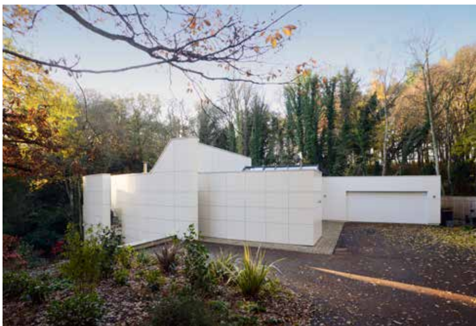
Like rocks in the storm: These walls stay watertight.