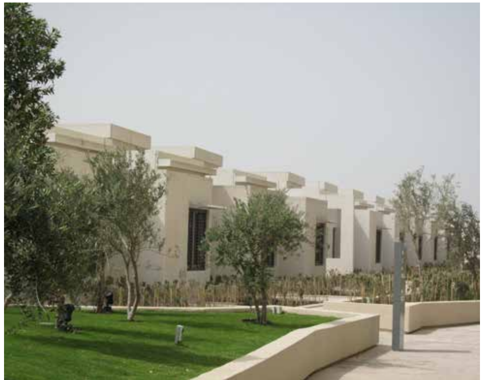
The housing complex covers 868 apartments that range from single-bedroom units to pent-houses spread over five luxurious residential towers and 14 premium villas.

The clubhouse has an origami concept design. It also houses a selection of retailers which residents can patronize, including a supermarket, a laundry, a beauty lounge, a pharmacy and a coffee shop. This new mode of community living sounds quite attractive, doesn't it? <