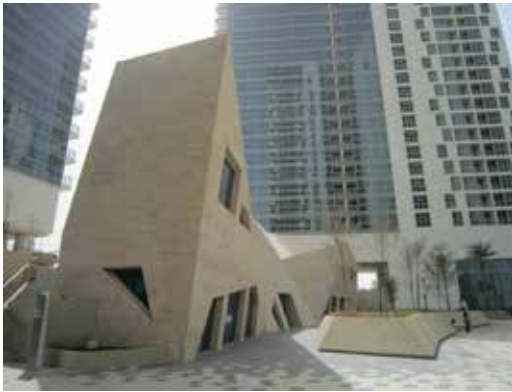
The clubhouse has an origami concept design.